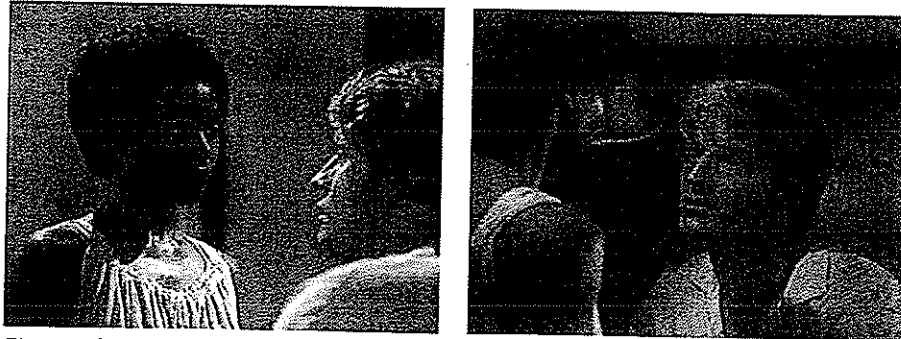
Fig. 3. The Master and the Wench: "...put your eyes on me... look at me straight into my eyes." Video frame enlargement.

sex as subjugation and reclamation. Sex makes slave subjects who transform themselves by claiming entitlement (e.g., when Ellen negotiates freedom for her child) and pleasure (e.g., when Blanche and Mede experience orgasm). Sex also produces objects—mixed race chattel, holding slaves into bondage while threatening the very order of slavery that prohibits interracial sex.