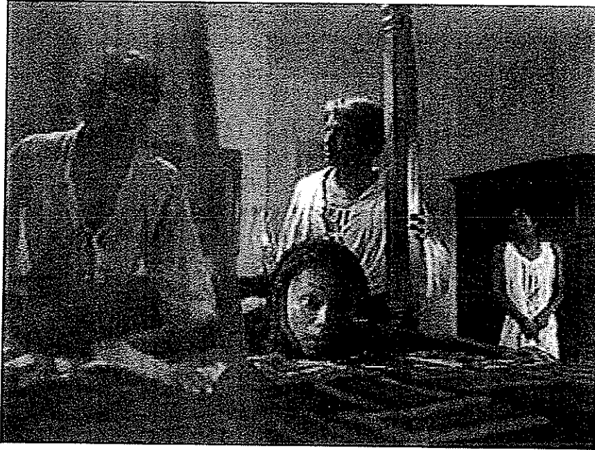
Fig. 2. The young wench beaten by her master. Video frame enlargement.

her body is sanctioned for rape, a very young wench demonstrates that she understands her lot. Her master hands her off, gives her like a pillow to Hammond's cousin, who happily claims his entitlement to violate her. Despite her seeming passivity to the ritual sexual assault, the scene is shot to prioritize the violence of the experience. Her eyes widen to the agony of his spanking. No matter how accustomed she may be, the pain continues to be shocking. While she may seem to accept her slavery, her facial expressions and bodily convulsions show the forcible violence and demeaning subjugation meant in these acts. The master demands her complicity in order to secure his pleasure in the need for her to say she likes it. Within this moment, she defends herself by making any semblance of her self and her experience unavailable to him. He shoves her to the bed, turns her over on her stomach, undoes his belt and whips her fiercely for her refusal. By assaulting her body, he forces her into a conscious acknowledgment of his mastery. She registers total contradiction through bodily, and not so much verbal, speech. The shot shows the drama of the wench's rape: a close-up of her pain in the foreground, and looming behind