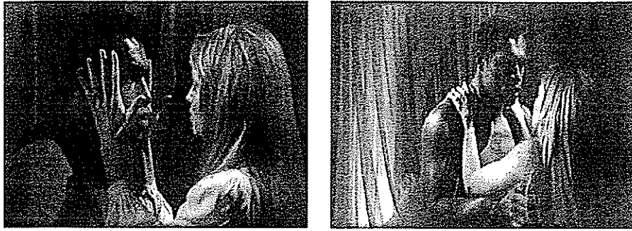
Fig. 4. The Mistress and Mandingo . Video frame enlargement.

sexual pleasure possible within relations of domination? In Scenes of Subjection , Saidiya Hartman emphasizes the problem of agency exemplified in assigning will to a subject who has no rights in the context of slavery. She argues that the “simulation of will disallows redress and resistance when slave subjugation is “determinate negation.” 16 But does not the lack of any will for the slaves reinscribe them into an unquestioned status of beasts of burden? Certainly, the crucial question is how to do the impossible measurement of agency without (1) obscuring the terror of slavery or (2) fulfilling Hartman’s diagnosis of a “spurious attempt to incorporate the slave into the ethereal realm of the normative subject through consent and autonomy.” 17 Consent, will, and choice are indeed questionable concepts in the context of slavery as racial domination. Yet sex acts in the film show both slaves and masters as subjects-in-struggle within circuits of power.