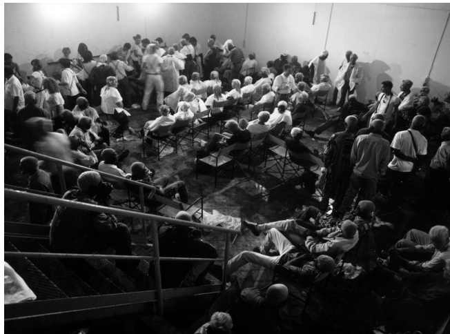
Sierra. Persons Paid to Have Their Hair Dyed Blond. Arsenale, Venice Biennale, 2001.