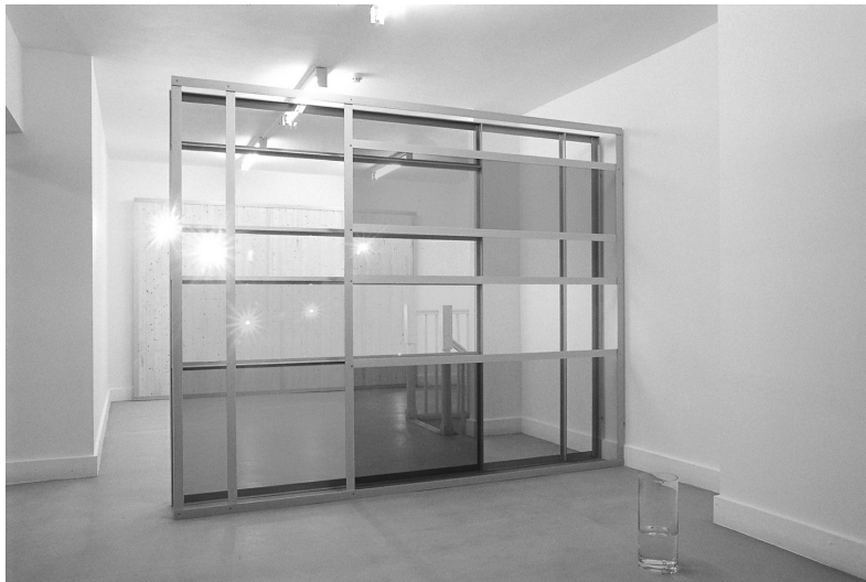
Gillick. Revision/22nd Floor Wall Design. 1998.