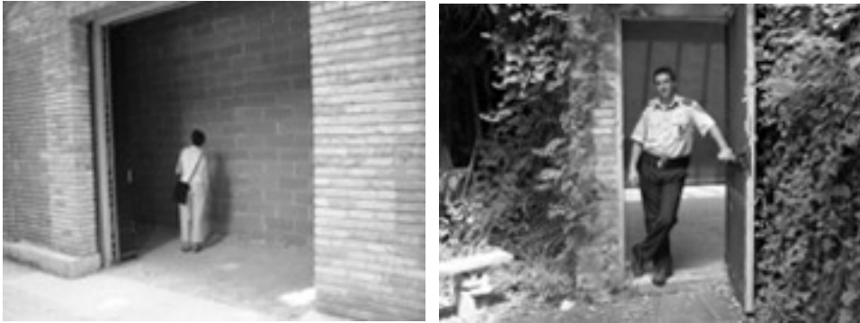
Sierra. Wall Enclosing a Space. Spanish Pavilion, Venice Biennale, 2003.

being fluid and unconstrained by exposing how all our interactions are, like public space, riven with social and legal exclusions. 58