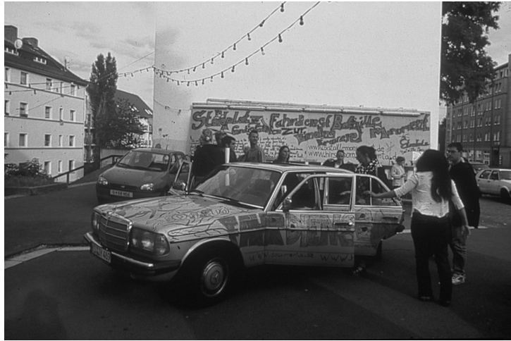
Thomas Hirschhorn. Right and facing page : Bataille Monument, Documenta XI, 2002.

contrived a curious rapprochement between the influx of art tourists and the area's residents. Rather than make the local populace subject to what he calls the "zoo effect," Hirschhorn's project made visitors feel like hapless intruders. Even more disruptively, in light of the international art world's intellectual pretensions, Hirschhorn's Monument took the local inhabitants seriously as potential Bataille readers. This gesture induced a range of emotive responses among visitors, including accusations that Hirschhorn's gesture was inappropriate and patronizing. This unease revealed the fragile conditioning of the art world's self-constructed identity. The complicated play of identificatory and dis-identificatory mechanisms at work in the content, construction, and location of the Bataille Monument were radically and disruptively thought-provoking: the "zoo effect" worked two ways. Rather than offering, as the Documenta handbook claims, a reflection on "communal commitment," the Bataille Monument served to destabilize (and therefore potentially liberate) any notion of community identity or what it might mean to be a "fan" of art and philosophy.