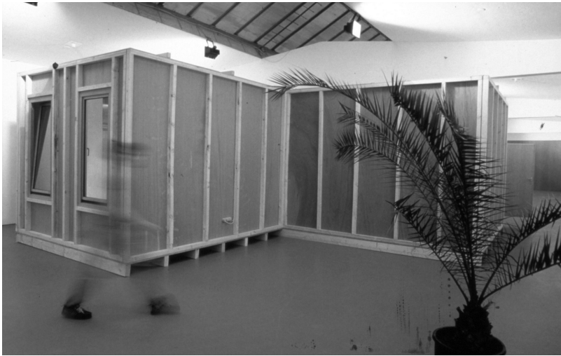
Tiravanija. Untitled 1996 (Tomorrow Is Another Day). Kölner Kunstverein, Cologne, Germany, 1996. Courtesy Gavin Brown's Enterprise, New York.

tion/performance was undertaken in Untitled (Tomorrow Is Another Day) (1996) at the Kölner Kunstverein. Here, Tiravanija built a wooden reconstruction of his New York apartment, which was made open to the public twenty-four hours a day. People could use the kitchen to make food, wash themselves in his bathroom, sleep in the bedroom, or hang out and chat in the living room. The catalog accompanying the Kunstverein project quotes a selection of newspaper articles and reviews, all of which reiterate the curator's assertion that "this unique combination of art and life offered an impressive experience of togetherness to everybody." 16 Although the materials of Tiravanija's work have become more diverse,