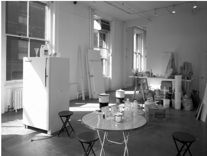
Rirkrit Tiravanija. Untitled (Free). 303 Gallery, New York, 1992.

hybrid installation performances, in which he cooks vegetable curry or pad thai for people attending the museum or gallery where he has been invited to work. In Untitled (Still) (1992) at 303 Gallery, New York, Tiravanija moved everything he found in the gallery office and storeroom into the main exhibition space, including the director, who was obliged to work in public, among cooking smells and diners. In the storeroom he set up what was described by one critic as a “makeshift refugee kitchen,” with paper plates, plastic knives and forks, gas burners, kitchen utensils, two folding tables, and some folding stools. 14 In the gallery he cooked curries for visitors, and the detritus, utensils, and food packets became the art