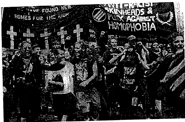
ACT UP with "Anti-Racist Skinheads & Punx against Homophobia" at LGTB march on Washington, 1993.