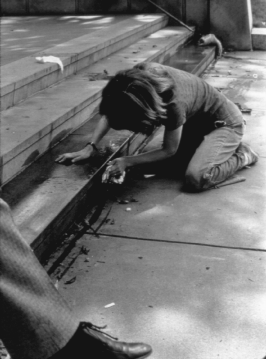
Mierle Laderman Ukeles, Hartford Wash: Washing Tracks, Maintenance Outside, Wadsworth Atheneum, Hartford, 1973.