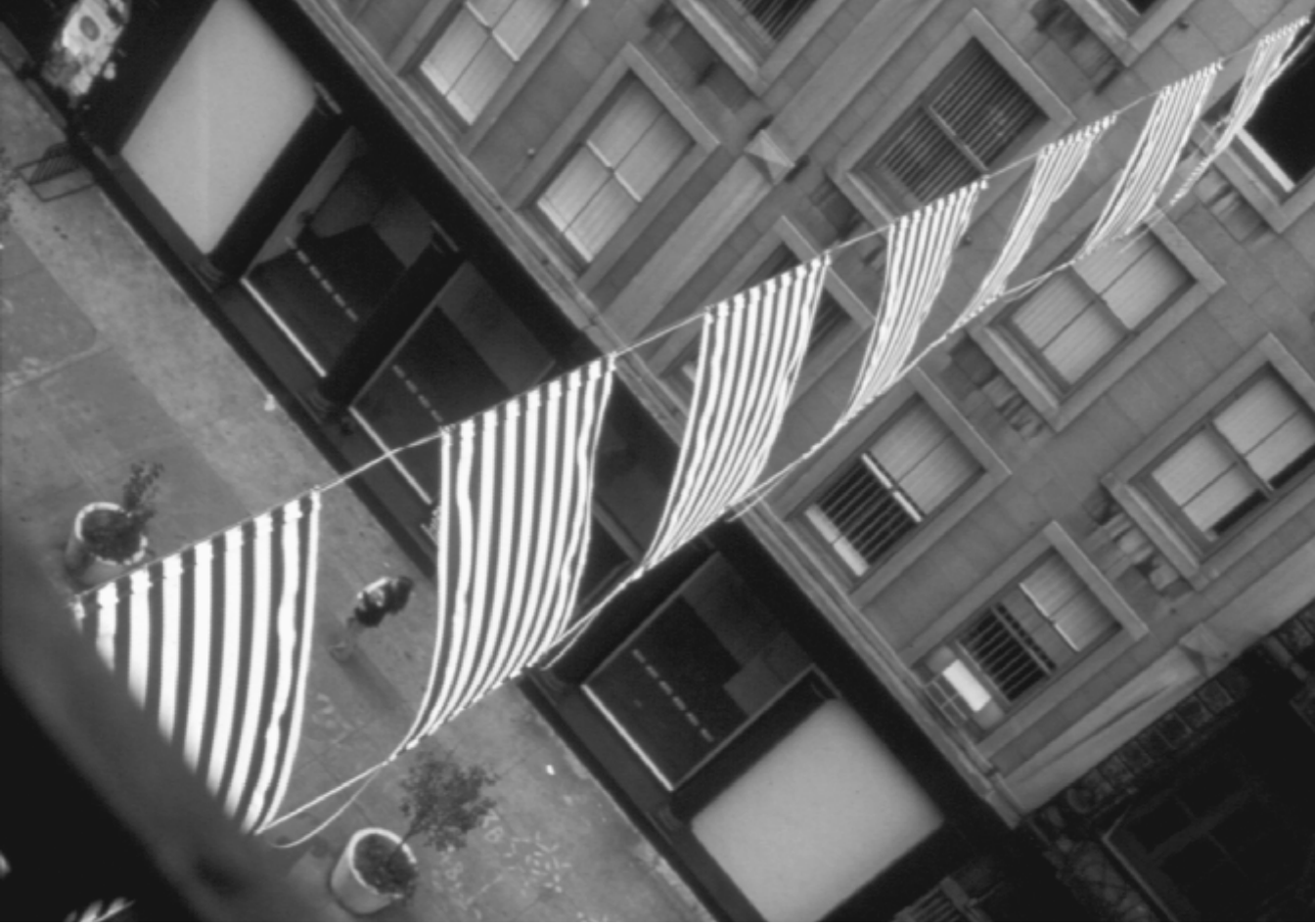
Daniel Buren, photo-souvenir: Within and Beyond the Frame, John Weber Gallery, New York, 1973.