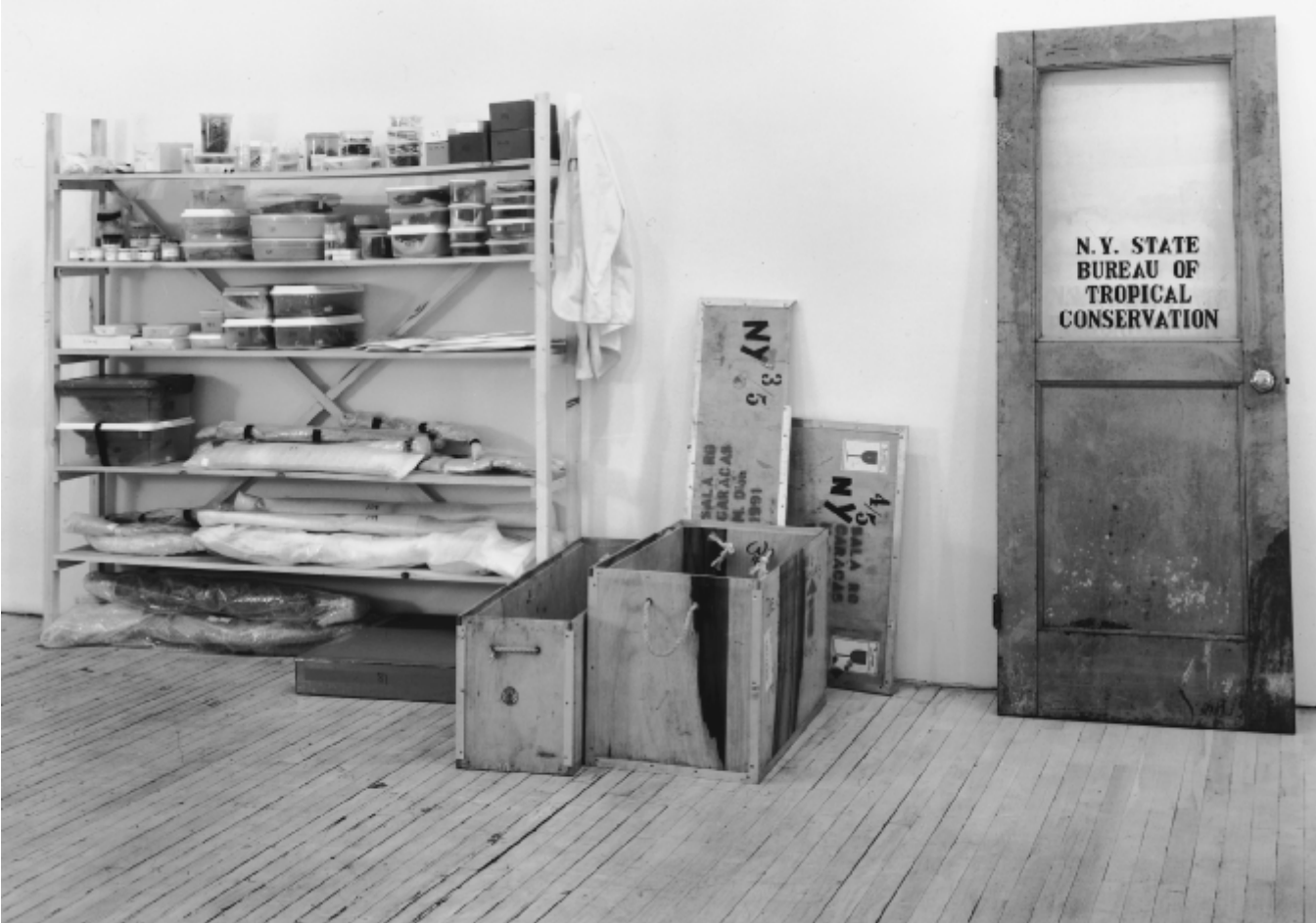
Mark Dion, New York State Bureau of Tropical Conservation , with materials from Orinoco River basin reconfigured for installation at American Fine Arts, Co., New York, 1992.