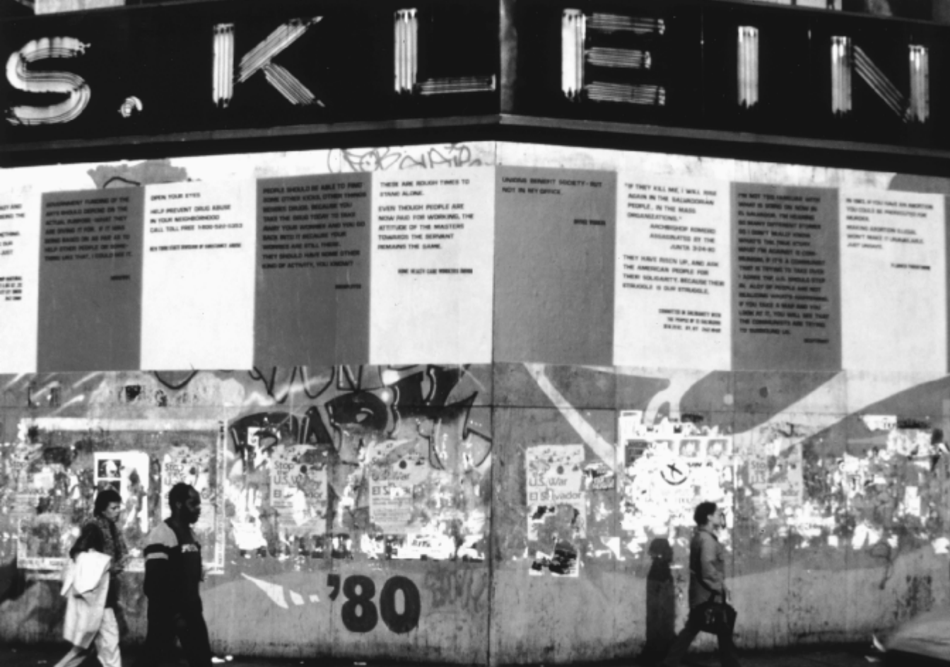
Group Material, DaZiBaos , poster project at Union Square, New York, 1982.