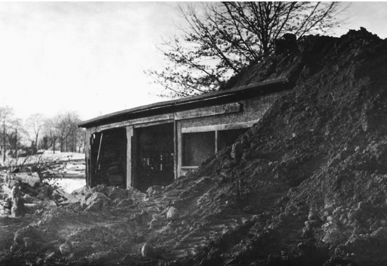
Robert Smithson, Partially Buried Woodshed, at Kent State University campus, 1970.