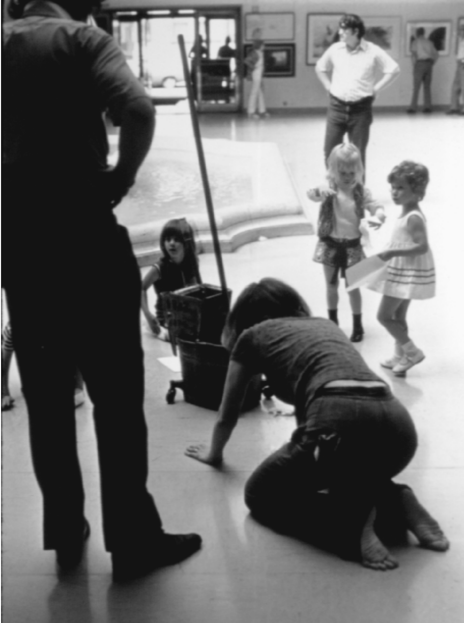
Mierle Laderman Ukeles, Hartford Wash: Washing Tracks, Maintenance Inside, Wadsworth Atheneum, Hartford, 1973.