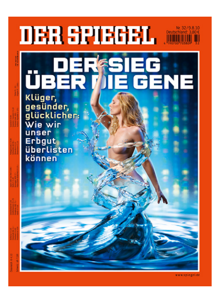
'Victory over the genes': Cover of Der Spiegel on epigenetics.

The term 'epigenetics' itself is fraught with misunderstandings (for an in-depth discussion, see an essay by Mark Ptashne, Curr. Biol. 17 , R233–R236). Initially coined by the