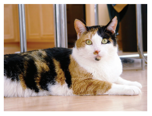
FIGURE 2 | A photograph of a calico cat.

Similarly bold effects of epigenetics occur in other species, too, and the effects can sometimes be traced