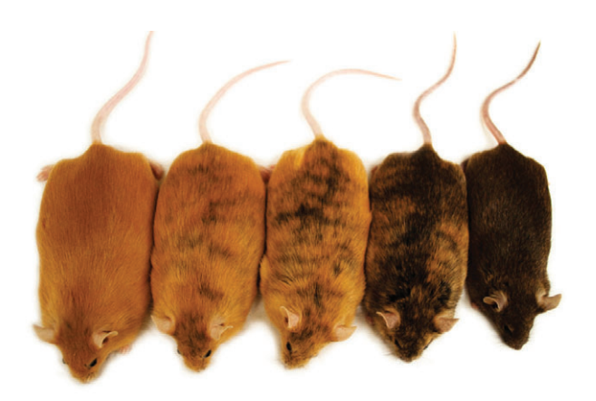
FIGURE 3 | A photograph of mice that are genetically identical, but nonetheless have a spectrum of coat colors. (Reprinted with permission from Ref 13. Copyright 2012)

Some of the most compelling data on the epigenetic effects of experience have come from the labs of Michael Meaney, Moshe Szyf, and their colleagues at McGill University. These researchers discovered that natural variations in behaviors of mother rats affect how newborn offspring react to stress later in life. Specifically, although all normal mother rats lick and groom their newborn pups, mothers that lick and groom their pups a lot have offspring that grow up better able to tolerate mild stressors in adulthood; pups that are not licked and groomed as much ultimately behave more fearfully when stressed.<sup>17</sup> When the McGill researchers looked for epigenetic effects of these early experiences, they discovered that reduced exposure to postnatal licking and grooming leaves particular DNA segments highly methylated in cells within the brain's hippocampus. Therefore, these DNA segments are downregulated in the affected hippocampal cells, which ultimately leads to reduced production of a particular protein-called the glucocorticoid receptor, or GR-that helps regulate stress.<sup>18</sup> Subsequent work with rodents revealed similar epigenetic effects of early experiences on other DNA segments in other brain areas as well.<sup>19,20</sup>